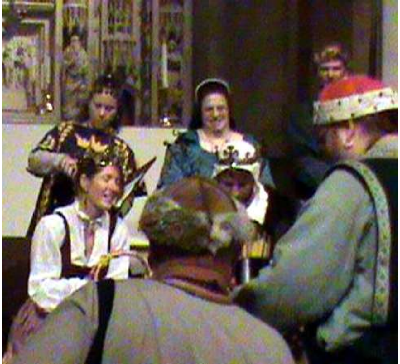
Photo by Lucy E. Zahnle (SKA Lady Dulcibella de Chateaurien)©2012 Used with permission.