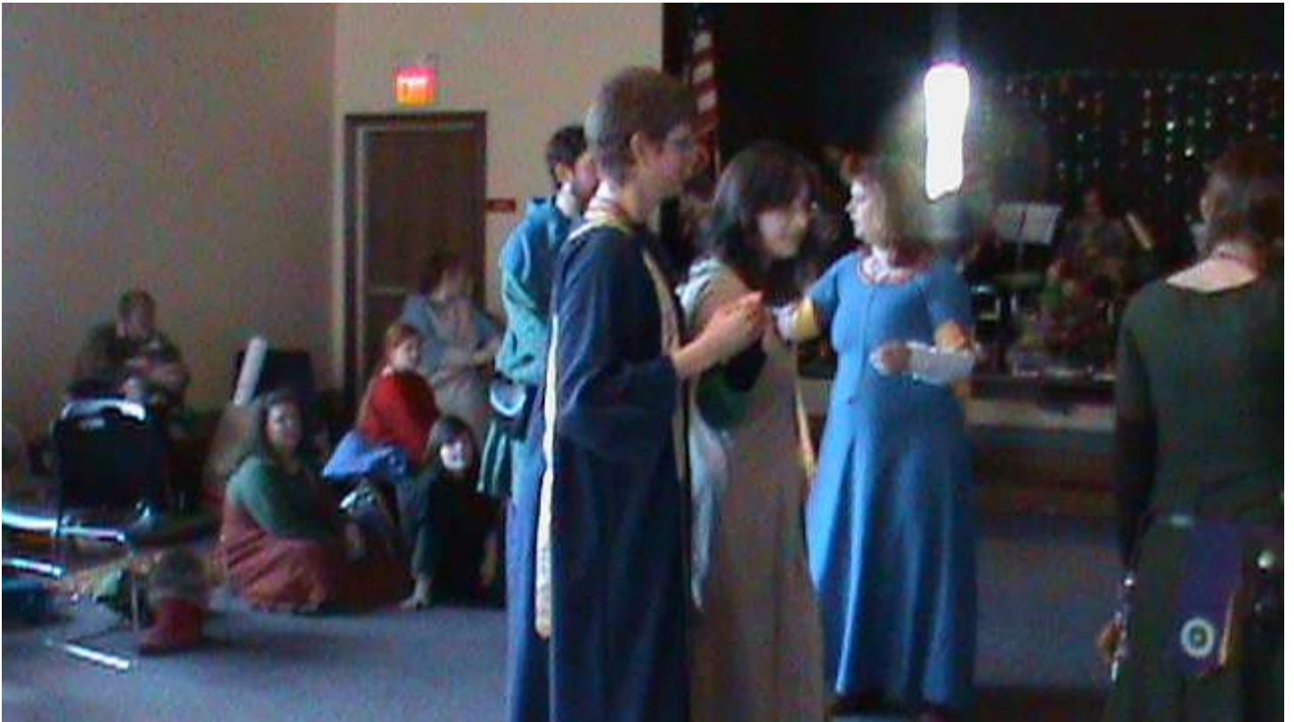
Music and Dancing in the Common Room