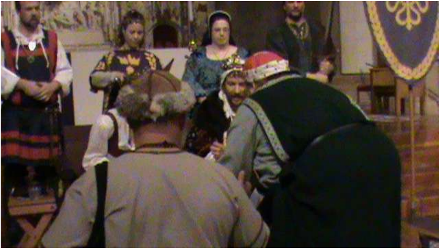
Shire Calanais presents its tithe to the king. He seems pleased. Huzzah!