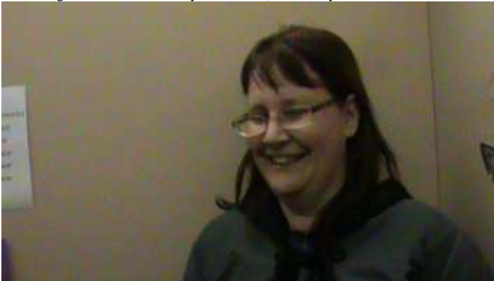
Both Images Below © 2012 Lucy E. Zahnle (SKA: Lady Dulcibella de Chateaurien). Used with permission.

Lord Kristoph dodges the paparazzi! (Doesn't want his noble family's reputation sullied by the taint of trade, no doubt...)