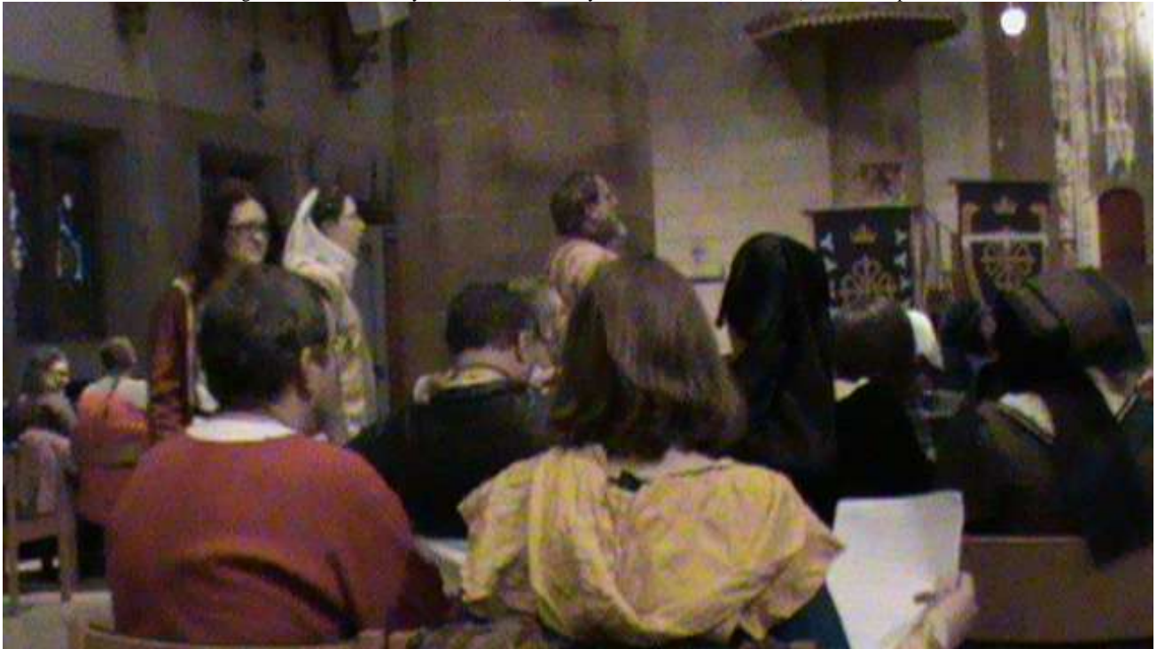
Singing before court starts

Both Images Below © 2012 Lucy E. Zahnle (SKA: Lady Dulcibella de Chateaurien). Used with permission.