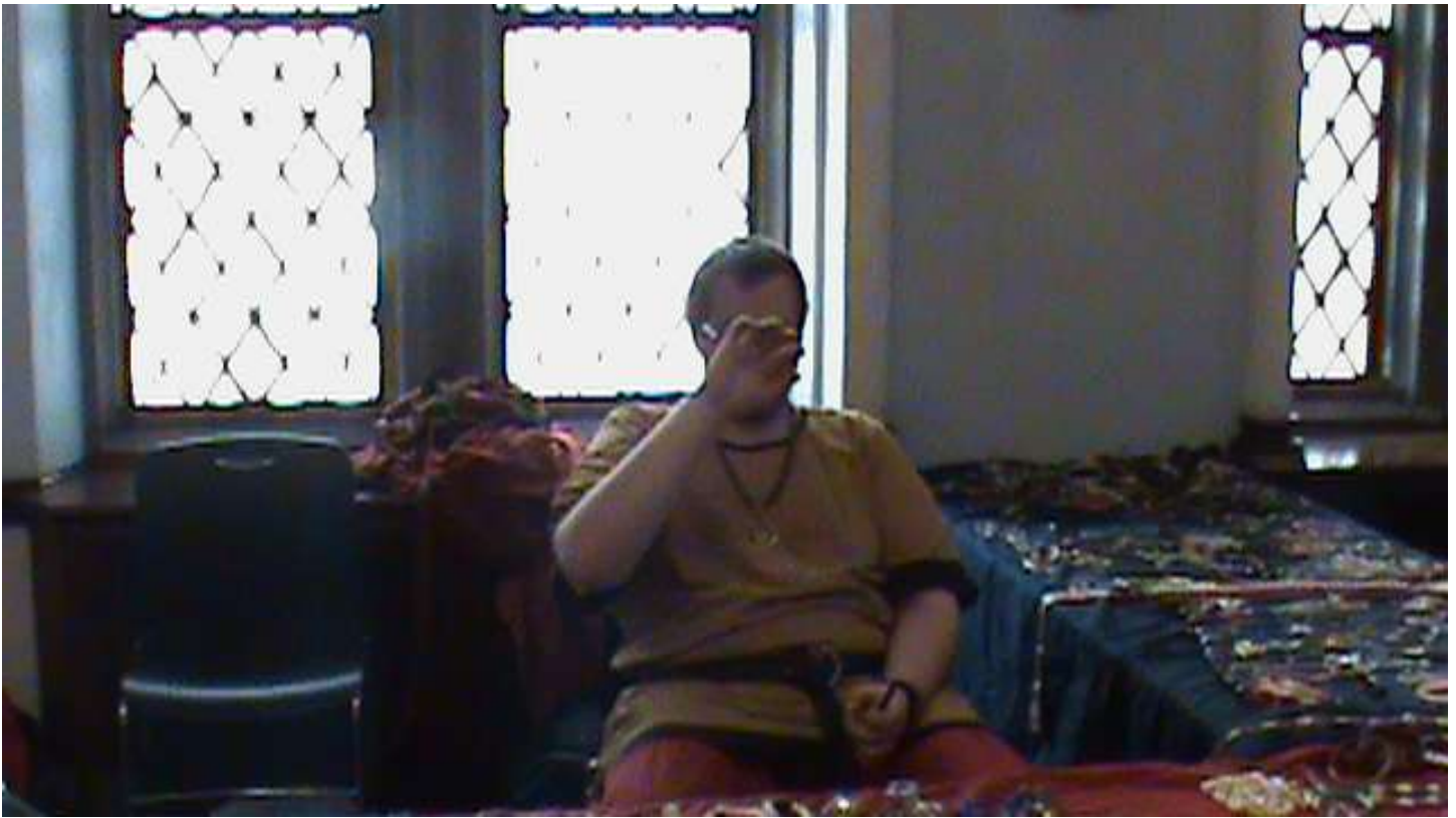
© 2012 Lucy E. Zahnle (SKA: Lady Dulcibella de Chateaurien). Used with permission.

Lord Kristoph dodges the paparazzi! (Doesn't want his noble family's reputation sullied by the taint of trade, no doubt...)