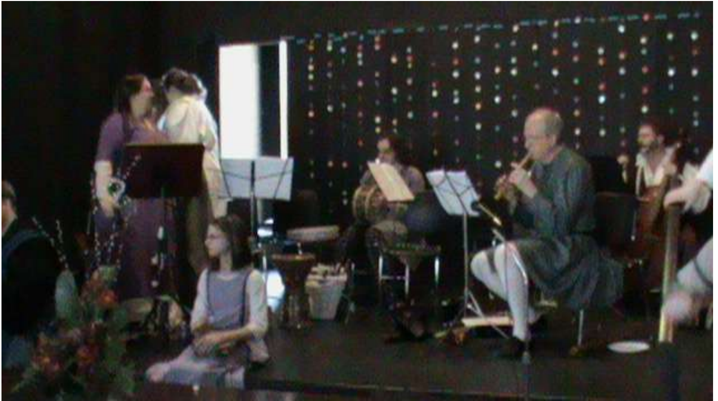
Both Images © 2012 Lucy E. Zahnle (SKA: Lady Dulcibella de Chateaurien). Used with permission.