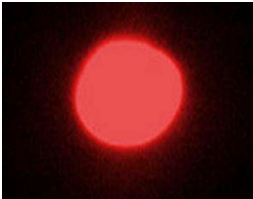
Image © 2012 Lucy E. Zahnle (SKA: Lady Dulcibella de Chateaurien). Used with permission.

© 2012 Lucy E. Zahnle (SKA: Lady Dulcibella de Chateaurien). Used with permission.