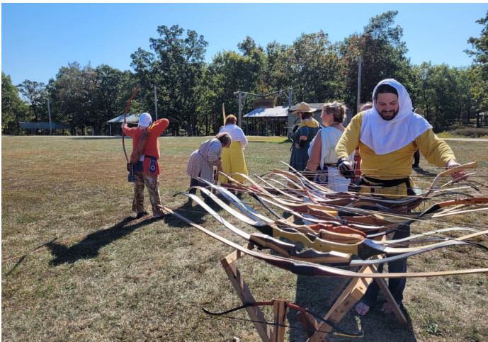
Bows stand ready for archers at Autumn Arrows XXXII.