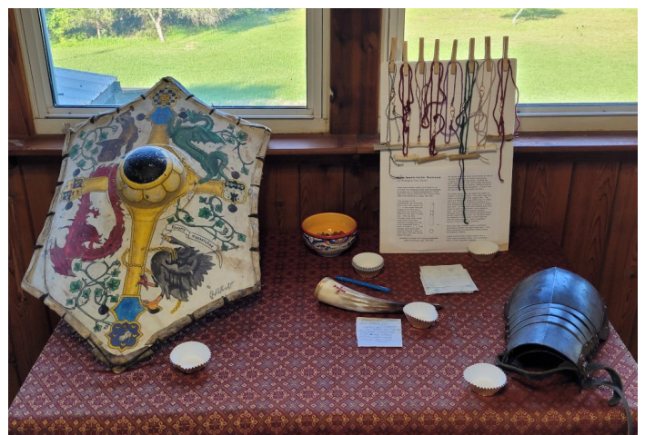
This year's Shire A&S Championship entries at our Annual Shire Picnic.

Complete meeting minutes are available in the Files of our Facebook group, and by request from the Chronicler.